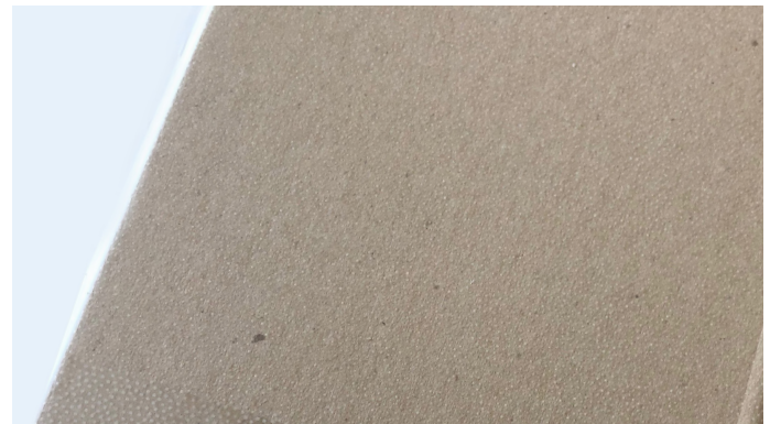
Solidboard up-close with one side anti-slip.

Industrial use within the furniture and packaging industry as the product is flexible yet robust and does not break easily.